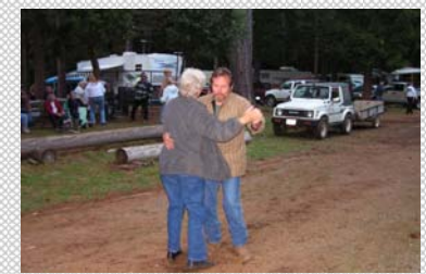
Dancing to Karaoke Saturday night at CMA shoot.